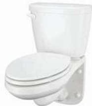
Maxwell WH BO

Height.....30 1/2" Width..... 17 1/4" Depth.....27" Rough-in ..... 4" Water Surface from Rim..... 5 1/4" Trapway (min) .....1 3/4" Water Surface .....9 7/8" x 7 1/4" Water Seal .....2 5/8"