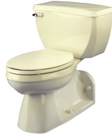
Ultra Flush BO

Rough-in (vertical) ..... 4 1/4" Trapway (min)..... 2" Water Seal ..... 3"