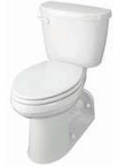
Maxwell FM BO

Height .....30 1/2" Width.....17 1/8" Depth.....27 1/2" Rough-in.....41/4" Water Surface from Rim..... 5-1/8" Trapway (min)..... 2" Water Surface .....95/8"x 7-3/4" Water Seal .....2 1/4"