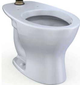
CT725CU(F) come with TORNADO FLUSH®